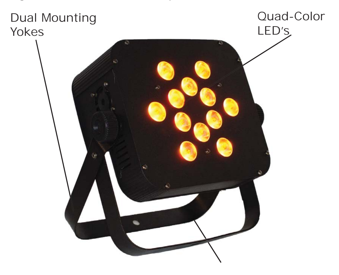
Figure 1: The Puck™ Q12 Pin-Up Picture